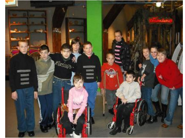
Children enjoying An Orphan Smiles sponsored outing.

Emergency Fund – Have support available to react immediately to life threatening situations.